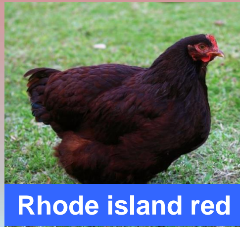
Rhode island red