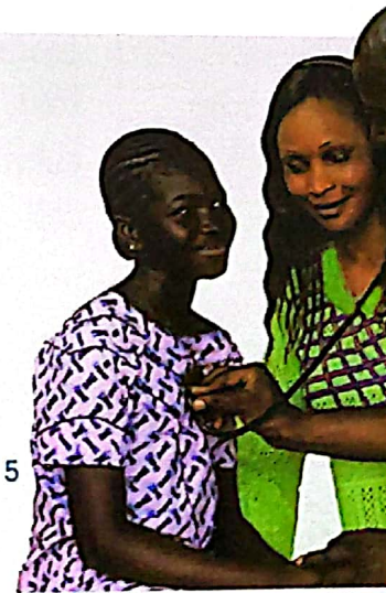
▲ Healthcare worker a pregnant woman

B Many small villages in Rwanda, in Africa, are far from cities. There are no doctors or hospitals . What happens when a pregnant woman or new mother has a health problem? These days, the government is giving cell phones to healthcare workers . They can call a doctor with their questions. The doctor gives them directions, and they can help the woman.