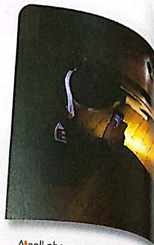
A cell phone can be used as a flashlight.

D All hikers need a cell phone. It can save their lives. In New Zealand, for example, two tourists