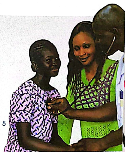
▲ Healthcare workers help a pregnant woman.

B Many small villages in Rwanda, in Africa, are far from cities. There are no doctors or hospitals . What happens when a pregnant woman or new mother has a health problem? These days, the government is giving cell phones to healthcare workers . They can call a doctor with their questions. The doctor gives them directions, and they can help the woman.