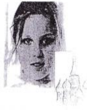
d _____ name's Tatiana.