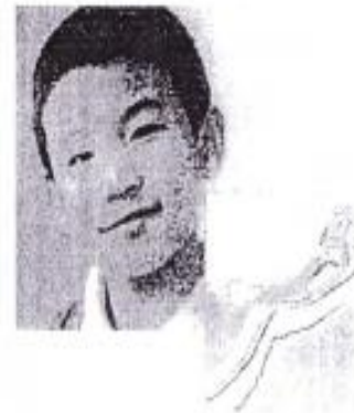
c _____ name's Yong.