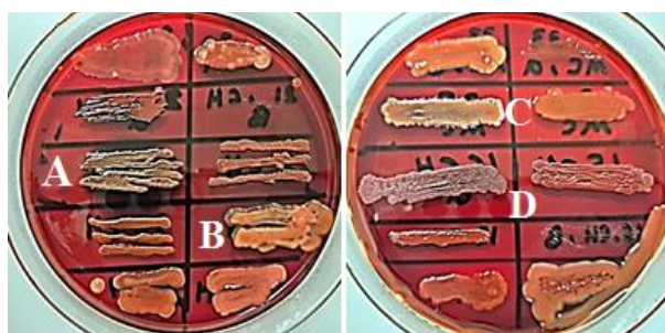
Fig. 1 : Different levels of biofilm formation exhibited by different bacterial isolates. (A=strong former, B= moderate biofilm former, C= weak former and D= no biofilm formation)