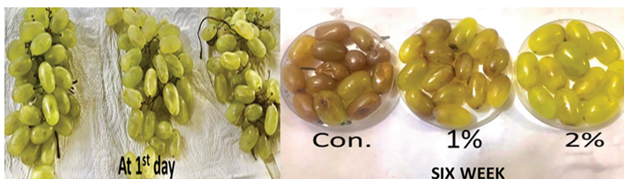
Figure 3: V. vinifera quality during the storage period for control (Con) sample and 1% and 2% C. myxa L. extract (CME) at the 1 st day and 6 th week.

evaluation of the 1% and 2% CME samples was good and very good, respectively, but the control sample was completely damaged. The sensory evaluation in the end of storage period for fruits in 1% CME was satisfactory and in 2% CME was very good.