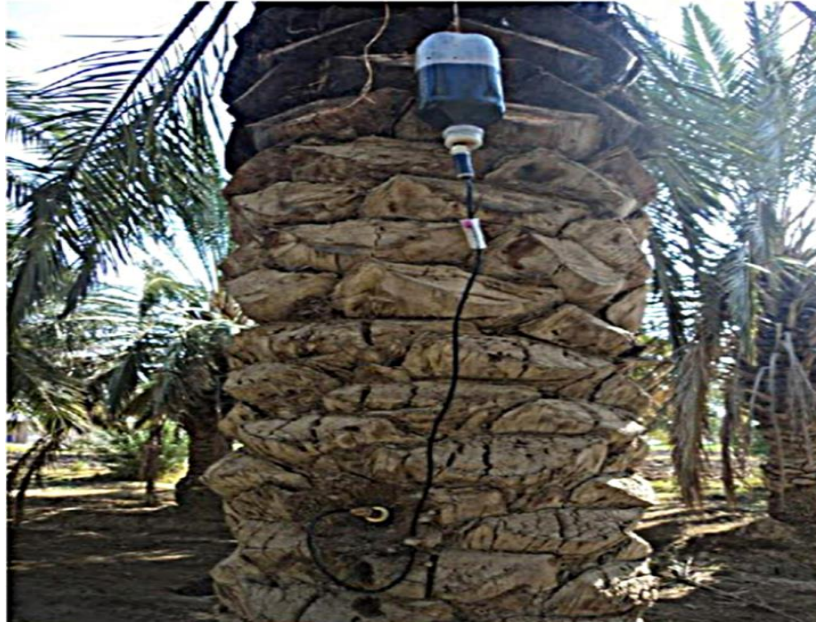
Fig. 1. Method of injecting palm trunk using feeder and injection tube (Abdul Wahid et al. (2012))