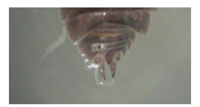
Fig. 3. Front edge straight with poleon, the exopod was spearshaped.