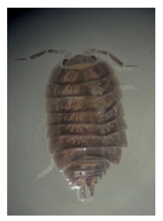
Fig. 2. The dorsal outer covering is smooth.