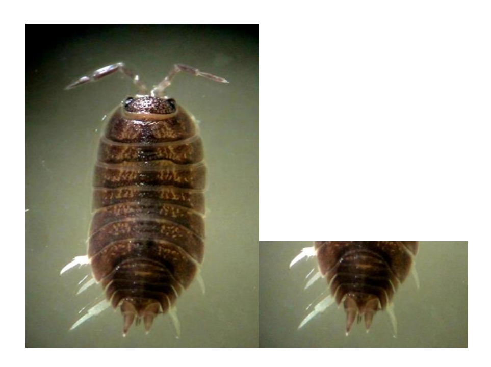
Fig. 1. Dorsum with exopod having a triangular posterior lobe and endopod tip slightly bent inwards.

Porcellionides pruinosus ( Brandt, 1833 ): Porcellionides pruinosus (Fig. 1) is a medium sized (to 12mm body length) woodlouse of distinctive appearance (and habitat). It is typically a purplish-brown in colour with a characteristic blue-grey bloom (but rarely may it be orange). The body colour contrasts against the long whitish legs and the pale annulations on the antennae. The body has an obviously stepped outline allowing rapid movement, the antennal flagella comprising two segments and with two pairs of pleopodal lungs. These specimens certainly belong to the genus and subgenus Porcellionides. This species is morphologically close to P. pruinosus from which it differs in the more granulated dorsum with exopod having a triangular posterior lobe and endopod tip slightly bent inwards. Many specimens were examined, we illustrate the main characters of this species (Fig. 1).