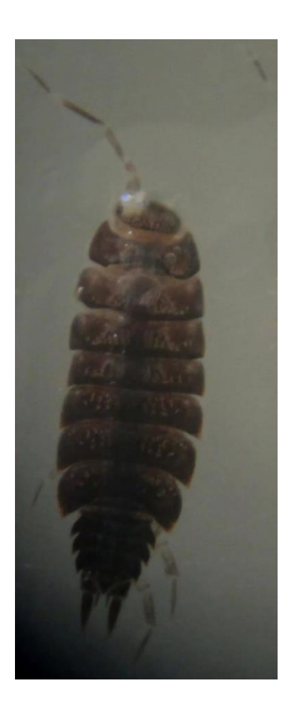
Fig. 4. Porcellio Scabir.