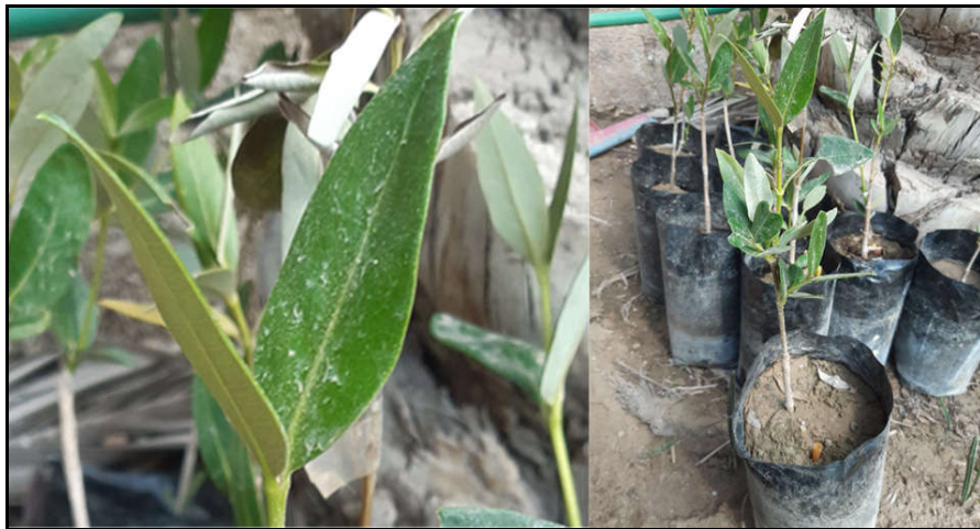
(Figure 2) Plant samples of Avicennia marina with normal phyllotaxis characterized by the presence of two leaves at each node, arranged in an opposite manner.

Among the collected samples, three were obtained from plants featuring two leaves at each node (opposite leaves) (Figure 3), while the remaining two samples were derived from plants with three leaves at each node (whorled leaves) as shown in Figure 4. Avicennia marina is identified by its leaves arranged in opposite pairs pattern ( Fuenzalida et al. , 2023) .