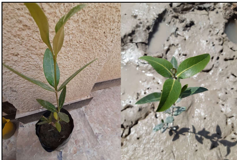
(Figure 3) Samples of Avicennia marina plant exhibiting abnormal phyllotaxis, marked by the occurrence of three leaves at each node, organized in a whorled leaf pattern.

Mangroves frequently develop various salt adaptive mechanisms ( Nizam et al. , 2022) ,in addition to alter the configuration of their leaves to enhance the balance of energy within the