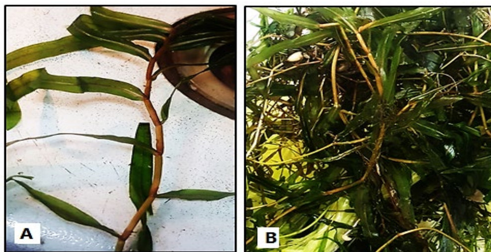
Fig.1. The collected Potamogeton pusillus .

were determined onsite using pre-calibrated electrodes. Triplicate samples for their chemicals were analyzed according to APHA (1985).