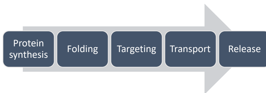
Fig. 2: Microbial aspartic protease secretion steps

The mechanisms of microbial aspartic protease secretion are a complex and multi-step process. It involves protein synthesis, folding, targeting, transport, and release. These enzymes are essential for microbial metabolism and pathogenesis, and understanding their mechanisms of secretion can lead to the development of new therapeutic strategies to target them. The study of aspartic protease secretion is an ongoing area of research, and further exploration of these mechanisms will shed light on the complex interactions between microorganisms and their environment.