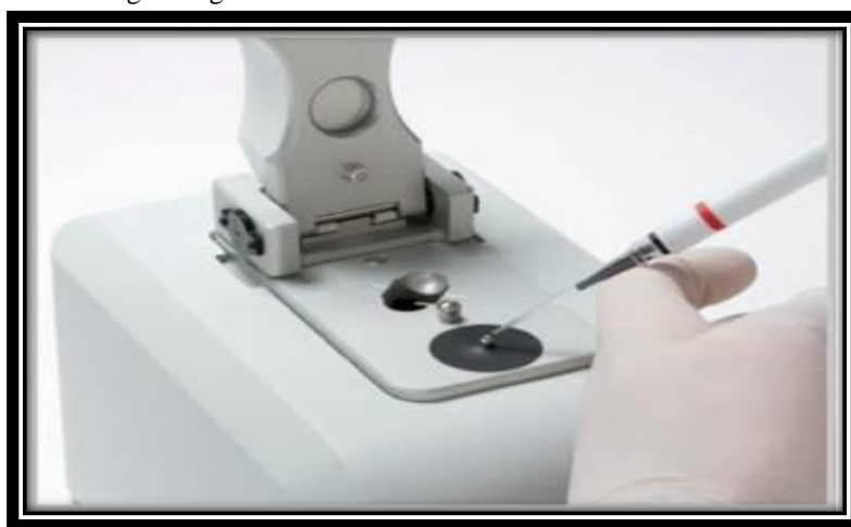
Fig. 1. The Nano Drop device, which is equipped with the American Thermo Scientific Company.

The amount of DNA was measured by a Nano Drop device prepared by the American company Thermo Scientific (Fig. 1) to identify the size of the genome ( \text{ng } \mu\text{L}^{-1} ). The presence of DNA was detected by electrophoresis technique in the presence of agarose gel at a concentration of 1%.