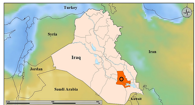
Fig. 1: Map of Iraq showing the collecting locality (circle) in Dhi Qar province southern Iraq

Sukkar district. The specimens are deposited at the College of Basic Education, University of Sumer, Dhi Qar, Iraq (CBEUS). The epigynes were cleared in a KOH/water solution until the soft tissue was dissolved. Photographs were taken using a Nikon camera connected to a stereomicroscope. Photographs of the epigynes were taken in a dish with alcohol. Leg measurements are provided as: total (femur, patella, tibia, metatarsus, tarsus). All measurements are in mm. The maps (Fig. 1, 5) were made with Marble ( https://marble.kde.org/ ; software version: 0.8.) and Shorthouse (2010). The sketches of the epigyne of L. chloris and the vulva of U. thaleri are based on several photographs from various angles and were made in Photoshop CS2 by T. Bauer.