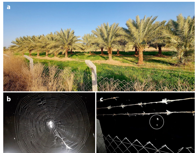
Fig. 3: Larinia chloris (Audouin, 1826), habitat. a. palm orchard and Alfalfa cropland; b, c. live specimens in their orb webs

Habitat. This species was found during the night on barbed wire placed on top of a chain link metal fence along one of the palm orchards and Alfalfa cropland on the banks of the AL-Garraf river, one of the main branches of the Tigris River, which passes through the centre of Al-Nasr District. Kunt et al. (2012) collected specimens of L. chloris from one of the regions near the Euphrates River in Turkey, and Alioua et al. (2020) collected it from vegetation around the freshwater basin of Sebkhet El Melah and the Wadi Kef Doukhane in Algeria. In the current study, the species was also found in a habitat close to water. Accordingly, it seems that this species prefers riparian and other humid habitats with a dense vegetation cover.