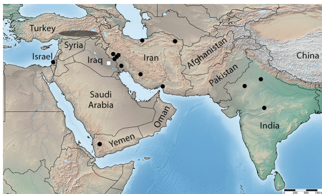
Fig. 5: Map showing the known distribution of Uroctea thaleri Rheims, Santos & van Harten, 2007 (circles: previous records in the literature (World Spider Catalog 2022); square: new record in Iraq; ellipse: presumed wider distribution in Southern Turkey, see Kunt et al. (2009))