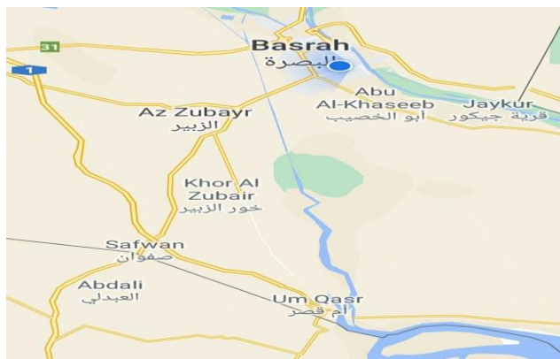
Fig. 1. Southern Basrah governorate on a map of Iraq

Where \rho_x and \rho_s represent the induced fission track density in (tracks/mm 2 ) for unknown and standard samples, respectively, and C_x and C_s represent the uranium concentrations in unknown and standard samples, respectively, in (ppm).