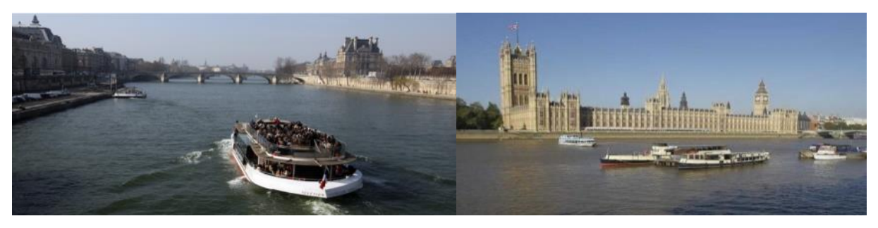
Figure 4. France http://forum.al-wlid.com/t279736.html

It boats operate on lines similar to regular transport buses work, good work capacity different speeds depending on daylight hours.