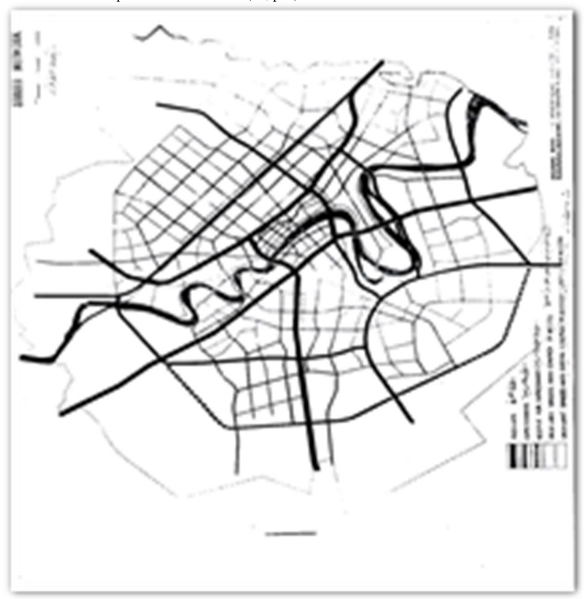
Figure 2. Main and subsidiary street network proposed by pool service (11, p32)[14]

public transport policy and within river transport, and how technology and scientifically developed and administratively to rise to the highest possible level, where Pat is one of the faces of the technological frantic race between the developed countries.