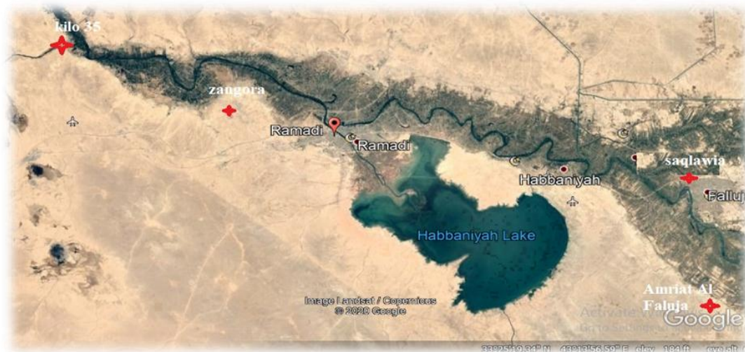
Figure 1. Map of collection site of the study area of Al- Anbar Province in West parts of Iraq

Projected experimental work is the study portion of groundwater quality management analysis through artificial recharge method[15]. Therefore, the experiments were carried to two municipal zones- West Zone (35 Kilo) and (Zangoura) and East Zone (Al- Saqlawiyah) and (Amiriyat al-Fallujah) of Al-Anbar Province in West parts of Iraq (Figure 1)