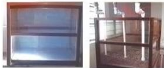
Figure 2. Experimental laboratory setup displaying the components and the sample collection point.

An experimental setup was developed in the laboratory as shown in Figure 1 to represent aquifer conditions. With transparent watertight metallic structure of proper dimension (1.10 m (L) × 0.75m (B) × 0.20m (H)) and the required arrangements for the inflow of rainwater into the aquifer material and to collect the water sample from the setup. Two PVC pipes with control valves of different diameters were given to intrude the ground water sample collected from the bore wells in the study area and two pipes were positioned to enter the rainwater in a measured quantity where these pipes appear as different diameters of field refilling wells. These recharges well pipes were positioned in such a configuration that for the dilution, homogeneous mixing of rainwater and existing aquifer mass water could occur as shown in the (Figure2).