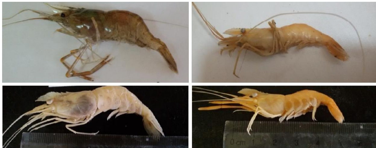
Figure 2. A. Macrobrachium equidens : A, curved upward rostral form, B, almost straight rostral form, C, straight forward, and D, is straight forward with a different front of the rostrum.

between 2 to 4 behind the orbit, distal teeth, more widely spaced in comparison with the others: inferior margin with 4 to 7 teeth. Carapace very smooth. Second pair of periopod of male is developed without pappose setal or, if present, distal cutting edges non-crenulate; developed males with protective setation (spinule or tubercle-like) on anterolateral carapace.