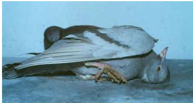
Figure 2 Neurological signs, disturbed equilibrium PPMV-1infection (10)