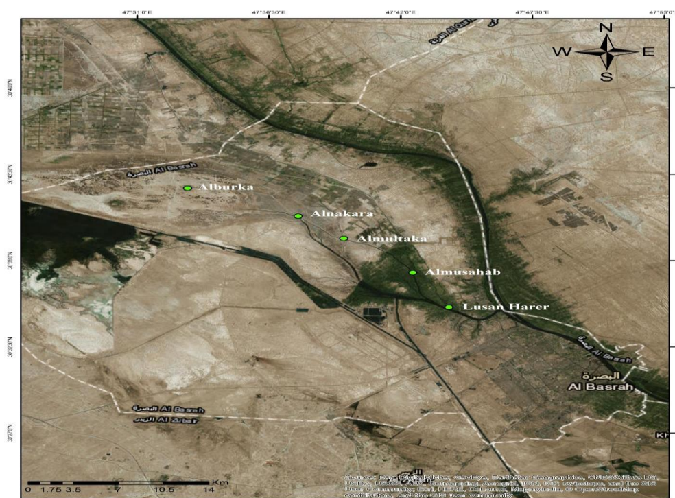
(Fig. 1) The study area.

The sediment samples were dried by using freeze dryer then grind finely in an agate electrical mortar and sieved through a 63 \mu\text{m} mesh sieve, stored until analysis. Twenty-five grams of sieved sediments were placed in cellulose thimble and extracted by using soxhlet intermittent extraction (Goutx and Saliot, 1980) with mixed solvents (120 ml) methanol: benzene (1:1 v/v) for 48 hrs. The combined extracts were saponification for 2 hours by adding (15ml) 4M MeOH(KOH) at the same temperature and cooled to room temperature.