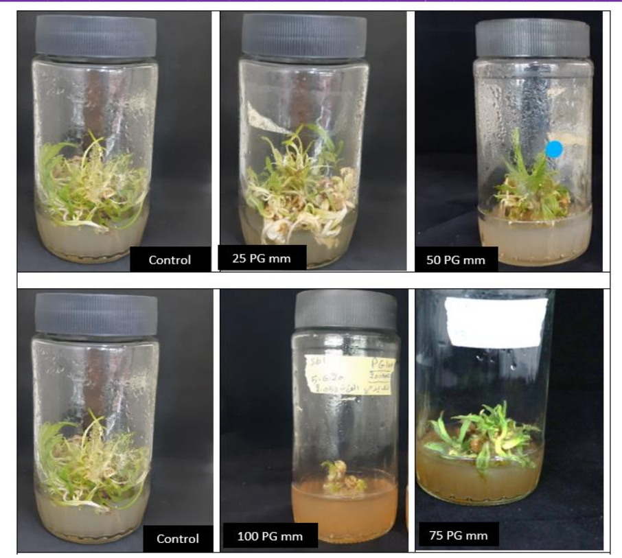
Figure (2): Buds formed in the multiplication medium containing phloroglucinol (0,25,50,75,100 (µmol).