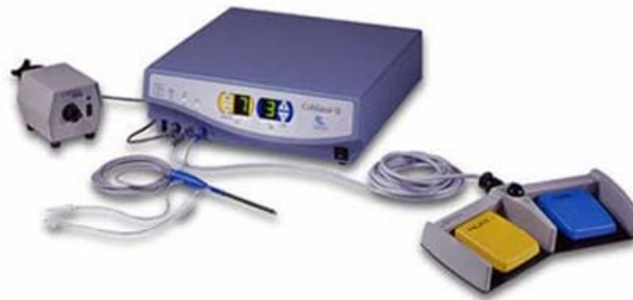
Figure 2: Smith &amp; Nephew Coblator II surgery system

Under general anesthesia with endotracheal intubation and the patient in supine position, Boyle Davis mouth gag was inserted and Darffin biopids were applied. Tonsillar clip was used to retract the tonsil medially then a tonsillar pillar incision was created by coblator wand. After that, dissection of the tonsil was progressed toward the tonsillar capsule with separation of the tonsil superiorly towards the inferior pole. Finally, hemostasis was completed by coblator wand coagulation( figures 3-5).