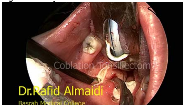
Figure 3: Making an incision by coblator wand.

Under general anesthesia with endotracheal intubation and the patient in supine position, Boyle Davis mouth gag was inserted and Darffin biopids were applied. Tonsillar clip was used to retract the tonsil medially then a tonsillar pillar incision was created by coblator wand. After that, dissection of the tonsil was progressed toward the tonsillar capsule with separation of the tonsil superiorly towards the inferior pole. Finally, hemostasis was completed by coblator wand coagulation( figures 3-5).