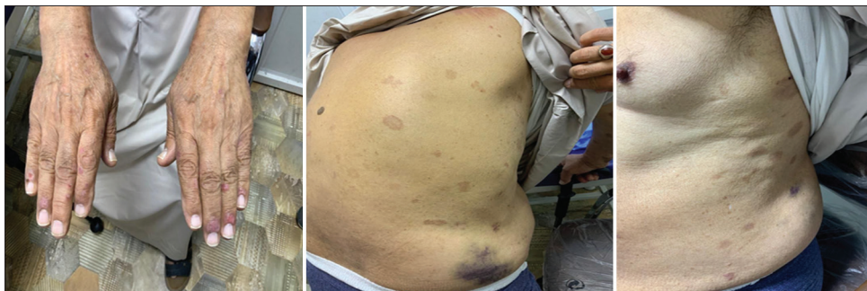
Figure 3: Images of the patient after treatment (Case 1)