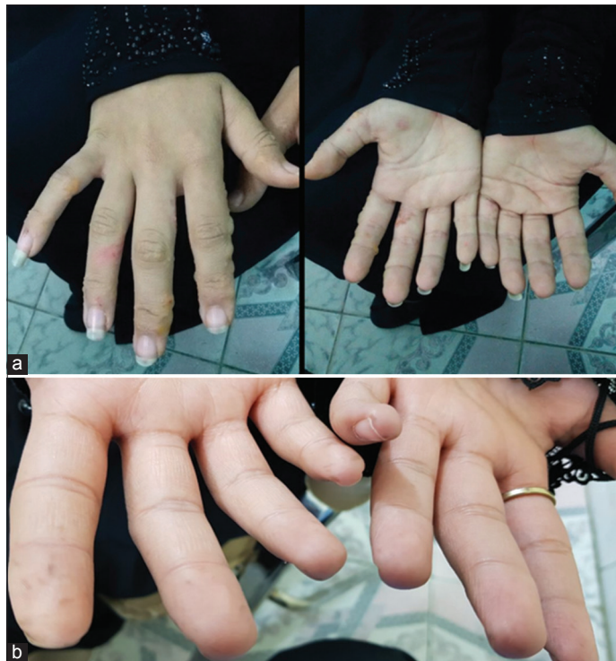
Figure 5: Images of the patient. (a) Before treatment; and (b) after treatment (Case 3)

occurs immediately [4]. There are many atypical forms of scabies that are very difficult to diagnose [5]. These atypical forms include scabies of the scalp, nodular scabies, scabies mimicking