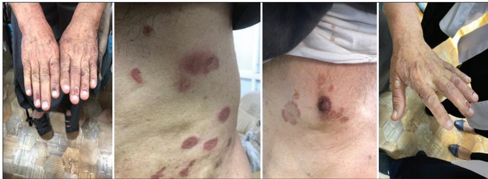
Figure 1: Images of the patient before treatment (Case 1)