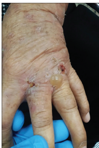
Figure 4: Image of the patient before treatment (Case 2)