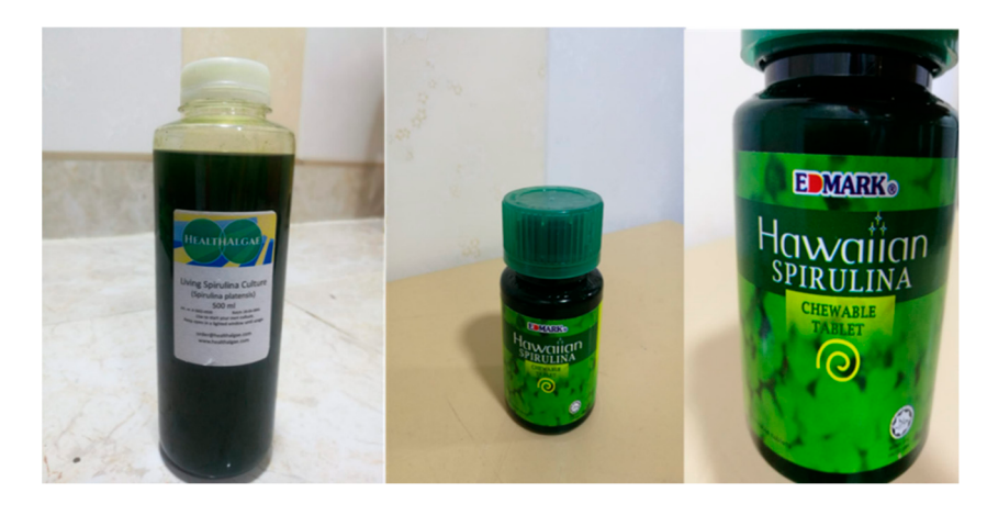
Figure 2. Various Spirulina-based products developed for commercialization.

not provide any health hazards to adult consumption, but they do pose health problems to children and babies when ingested on a daily basis [13]. In addition, 18 algal food supplement products were tested for the presence of toxins, and the results showed that 8 of the products contained cyanotoxins at concentrations that were higher than the threshold considered safe for daily use. According to the research of Roy-Lachapelle et al. [11], consuming 10–19 g of spirulina per day, and even up to 40 g in Africa, over an extended period of time did not result in any adverse effects for consumers. Spirulina supplements have been deemed "potentially safe" by the National Institutes of Health in the United States, providing that they are free of microcystin contamination [12]. Figure 2 presents a variety of blue-green algae in its many forms.