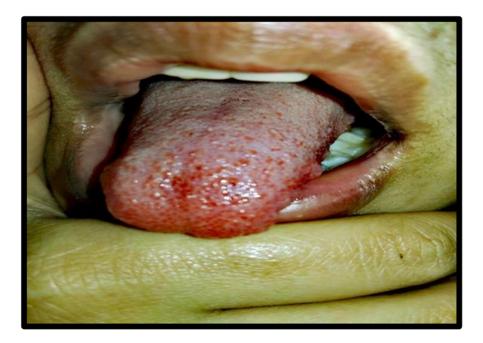
Figure 1: Clinical photograph of IDA patient (1) showing Angular cheilitis and atrophic glossitis with pseudomembranous candidiasis.

The growth of the isolated yeast on CHROMagar Candida medium showed light green color colonies, the growth in human serum showed germ tube formation and formed chlamydospore onto cornmeal with tween 80 medium Figure 2. biochemical identifications of the yeast isolated from the patient tongue with VITEK2 test revealed that it belongs to C. albicans . Oral macroscopic observation showed Angular cheilitis and atrophic glossitis with pseudomembranous candidiasis Figure 1.