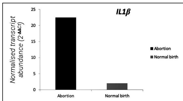
Figure 2. Relative expression of IL1β genes in the placenta of Cows

SD: Standard Deviation, CI: Confidence interval, SE: Standard Error