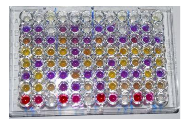
Таха (T) Staphylococcus aureus ssp. aureus URE MLT CAT SOF LAC bGA CEL

*The ratios were calculated by dividing the number of cell on number of conventional microbiological technique cell.