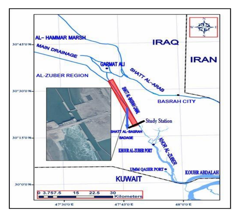
Figure 2. Schematic of Shatt Al-Basrah canal and study station at the west of Basrah city (MSC, 2016)

zone has significant variations in temperature; salinity; water density and quality, making it a conducive environment to the growth and reproduction of jellyfish in huge numbers.