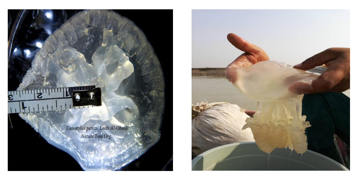
Figure 1. The first registration of the jellyfish ( Catostylus perezi ) in the north of the Shatt Al-Basrah canal in 2016 by the nature Iraq organization (Al-Obeidi, 2016).

The study station was selected at the following geographical position (30 °30.3'55.1 "N 47°82.6'38.1" E), which is located at the confluence of Shatt Al-Basrah canal with Khor Al-Zuber, Figure 2. In order to study the influence of human waste, it was necessary to choose the most sensitive and most important region which is the confluence of Shatt Al-Basrah with Khor Al-Zuber. As this region there is continuous mixing happened between the water of the canal with the water of the Khor Al-Zuber, where this region is under the influence of the phenomenon of tides. In addition, the confluence