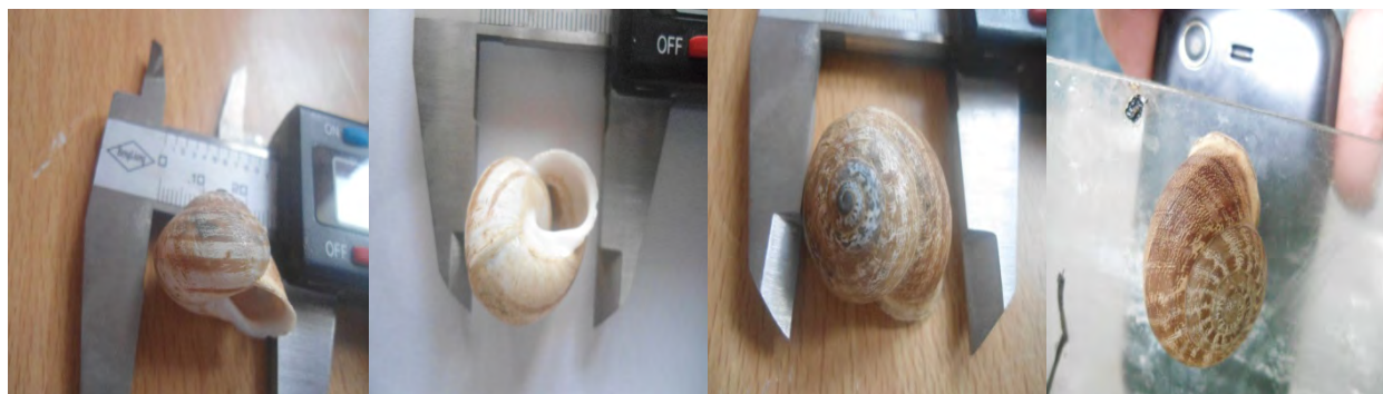
Fig. 2 The species E. vermiculata .

Both living and Shells of E. vermiculata were collected directly from the soil of the farms and the grasses herb plants, closely to the Shatt Al-Arab. In the Hareer region E. vermiculata is associated with the other land snails.