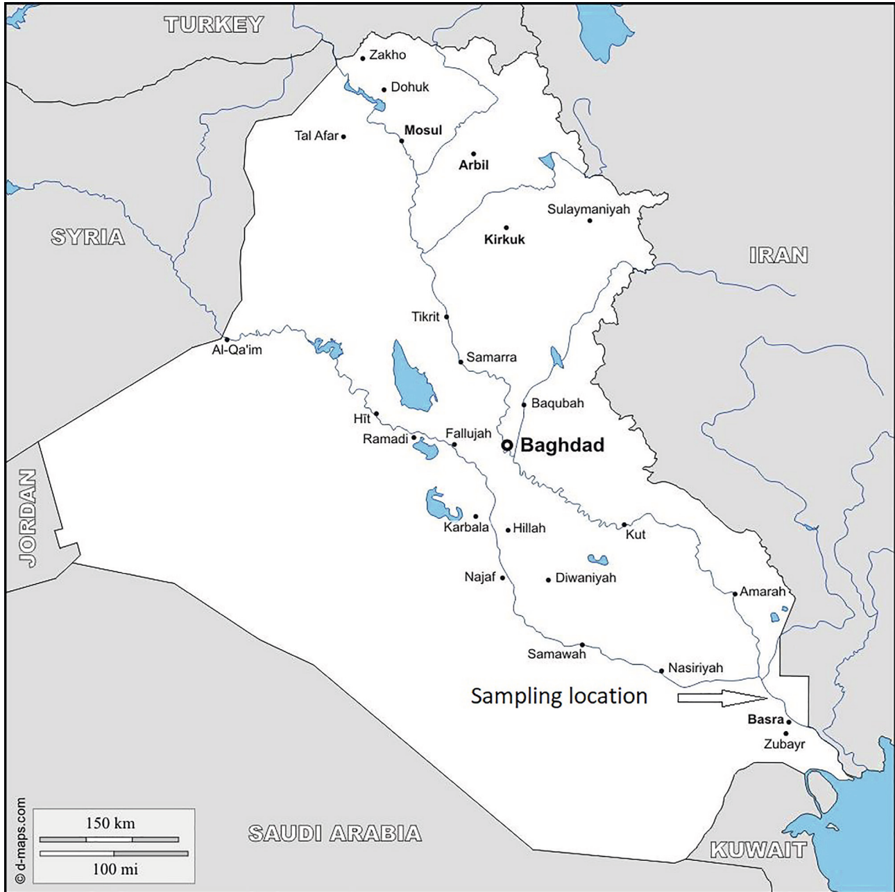
Fig. 1. Map showing the locality of collection (arrow) of Pterygoplichthys pardalis (Castelnaud, 1855) in the Shatt al-Arab River, Basrah, southern Iraq.

The present study reports on the presence of the Amazon sailfin catfish in the Shatt al-Arab River at Basrah, Iraq, where 175 individuals of P. pardalis were collected in 2017. This is the first record of this species from the freshwater system of Iraq in general and from the Shatt al-Arab River in particular.