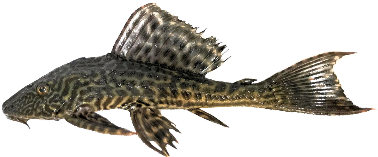
Fig. 2. Male of Pterygoplichthys pardalis (Castelnau, 1855) from the Shatt al-Arab River, Basrah, Iraq; 132.6 mm TL.

SAMAT et al. (2016) found that the Amazon sailfin catfish reaches maturity at 125 mm and 130 mm SL for males and females, respectively. With a size range of 125.7 to