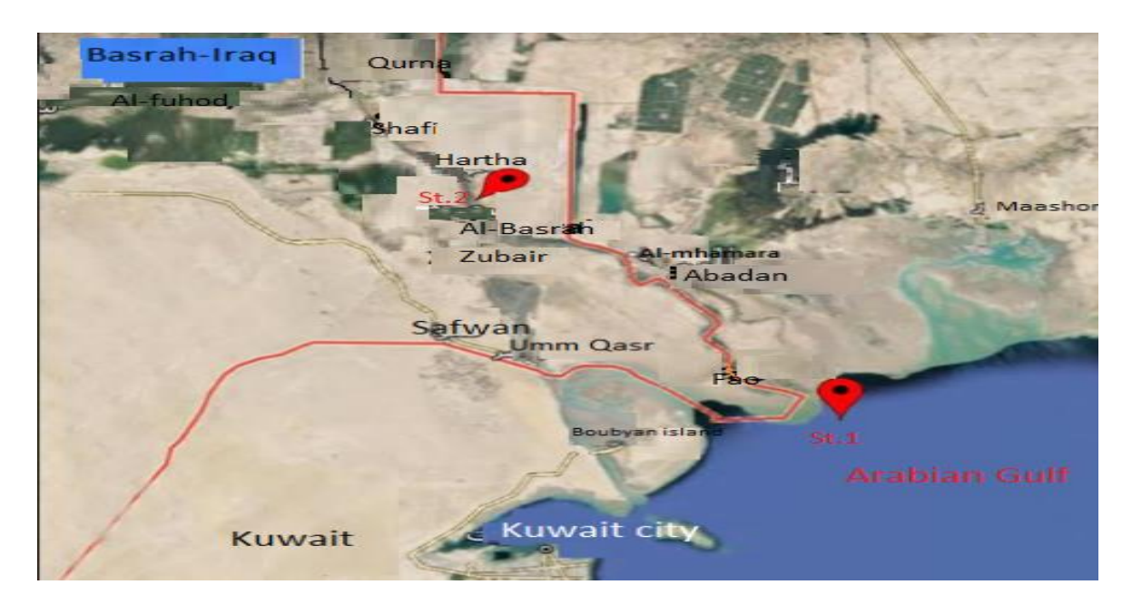
Figure (1). Location map showing fishing sites: (1) National Iraqi waters, and (2) Shatt Al-Arab River.

Flame Ionization Detector (FID). The device has a type separation column (Agilent 125-103 KHP-5) with dimensions (30 m \times 320 µm. \times 0.25 µm.). Fish samples were analyzed for a suite of 16 PAHs compounds.