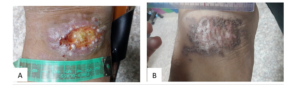
FIGURE 2: (A) cutaneous leishmaniasis at baseline, (B) the same lesion after six weeks of treatment with sodium stibogluconate injection plus topical imiquimod shows healing with a superficial non-atrophic scar and post-inflammatory hyperpigmentation.

Figures 2 demonstrate the type of scar in the IMI-treated group, while Figure 3 shows the healing with a deep atrophic scar in the placebo group.