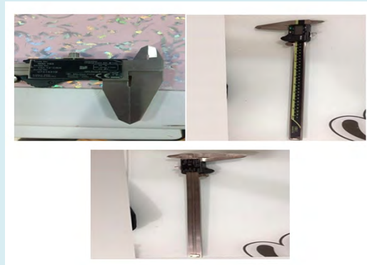
Figure 1: Verni caliper that used in anthropometric measurements.

All subjects with congenital auricular malformation of the external ear (pinna) and all persons with previous history of trauma to the external ear (pinna) or surgery are not involved in study. The anthropometric tests for "Pinna" external ear include total ear length (TEL), total ear width (TEW), total lobular length (TLL) and total lobular width (TLW), calculated by a specific investigator by Vernier caliper (Mitutoyo Corp., Japan) to 0.1 mm (Figure 1).