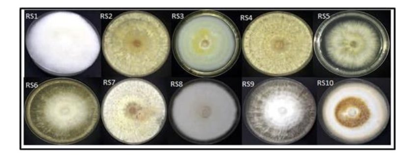
Fig. 1: Colour and shape of colonies Rhizoctonia solani isolates from soil and roots of tomato plants on PDA culture media in the incubator at 25°C for one week

*The letters RS stand for Rhizoctonia solani and the number beside them represents the isolate number