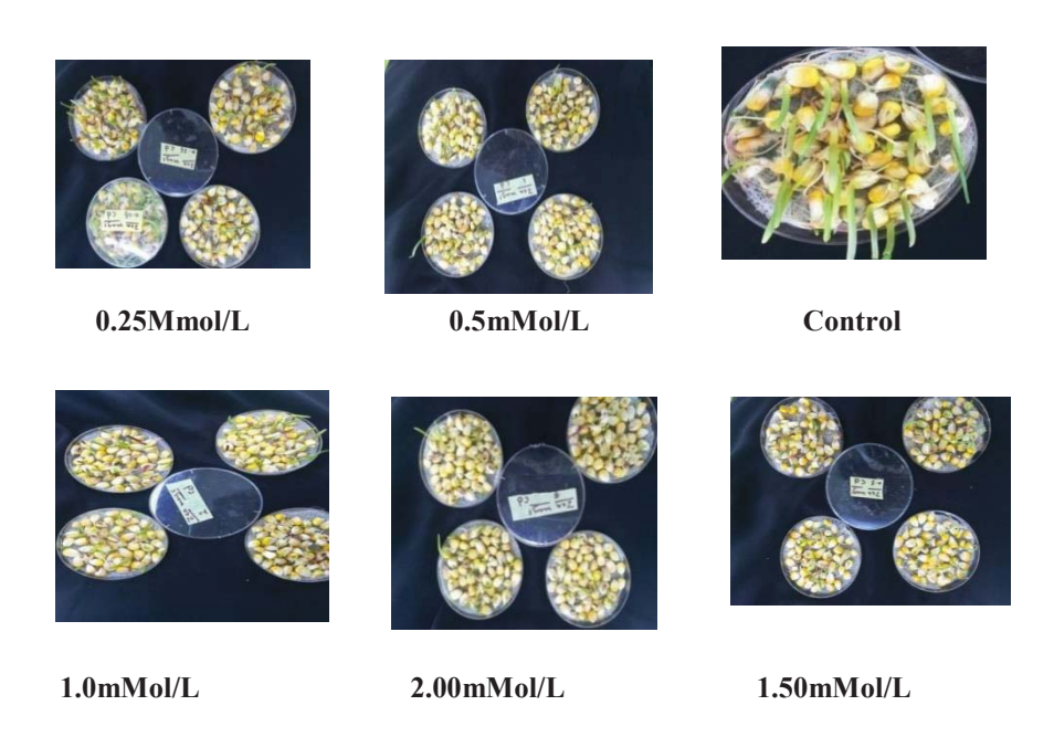
Picture (3): Effect of cadmium treatments on germination of Zea mays seeds