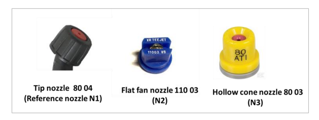
Fig. (3): A side view of the nozzle types used in the foliar spraying.

spray pattern, and application rate (Table 3). All these types are shown in the fig. (3). At the end of agricultural season, the maize harvesting was on 16/11/2019.