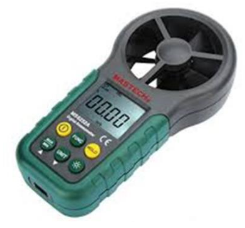
Fig. (5): A side view of the anemometer device.

The weather conditions such as temperature, relative humidity, and wind speed were recorded at the same time of foliar spraying using the meteorological device (Anemometer), Model MS 6253B with accuracy of \mp 0.02 (Fig. 5).