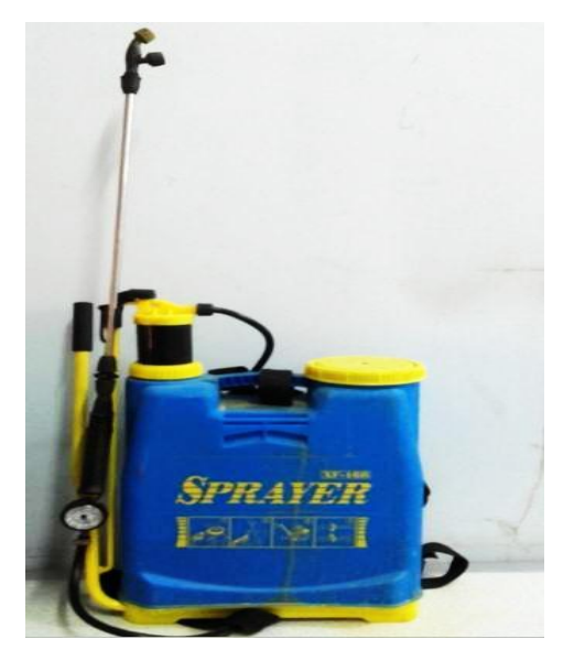
Fig. (1): A side view of the knapsack sprayer.

price, easy to maintain, and has small number of moving parts, in addition to its large use by farmers in the small and medium fields. The most important characteristics of the knapsack sprayer are shown in table (2).