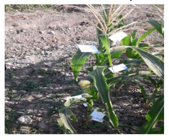
Fig. (4): Positions of the WPCs on the plant.

plant at different levels (top, middle, and bottom) as shown in the fig. (4) to calculate the sedimentation rate obtained on the plant and determine the density of the droplets.