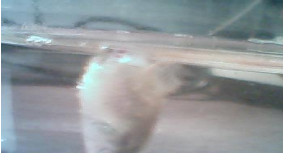
Pic. 3. Show heavy infection in the skin of fish C. carpio which attach by M. nipponense and infected by aquatic Saprolegnia parasitica . (16X).

From these results we can conclude the following: