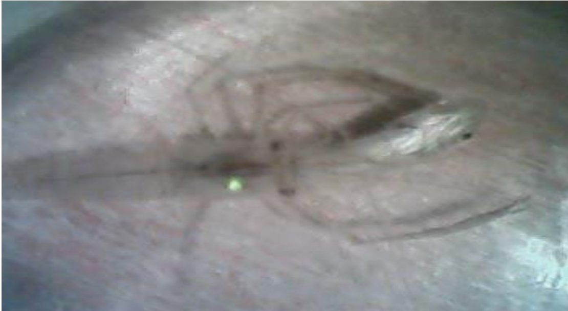
Pic. 2. Showing the consuming of M. nipponense to a half of the fish larva of C. idella .(4X).