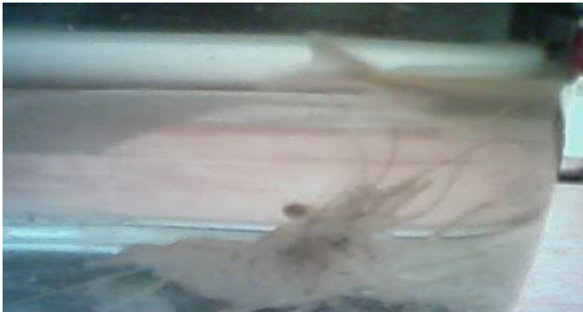
Pic. 4. Show the shrimp using its tentacles to attracting the larva of C. idella . (4X).

4 - In case of the size of the fish suitable for predation, but fails to capture them because of its speed and activity, which drains the power and activity of the shrimp in pursuit, the shrimp tend to be stagnate in one aspect using his thin and long tentacles by attracting the fish to him by moving them constantly in a way make that fish suggested that there is a kind of live food moving near it and if the fish moved towards the tentacles the shrimp will jumping quickly towards the fish to catch them and then starting to predation them (Pic. 4).