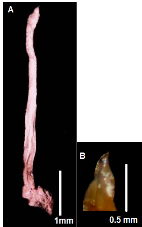
Figure 3. First male gonopod of Lyphira heterograna (Ortmann, 1892): A. whole gonopod; B. close-up of apical process.