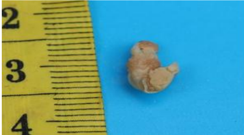
Fig. 3. Shows the size and color of the snail body Myosotella myosotis plate 2.