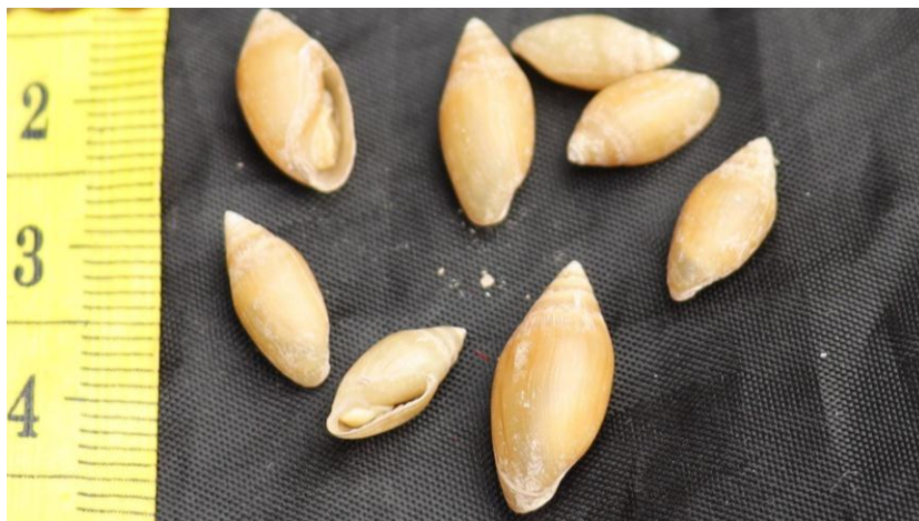
Fig. 2: Specimens of Myosotella myosotis plate 1.

Measurements: The shell length ranged between 5-16 mm and the width ranged from 3-6 mm (Fig. 2).