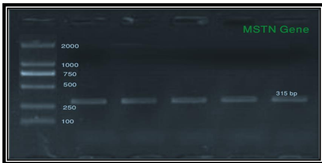
Fig (1): Amplification product of myostatin gene on agarose gel.

A total of (32) samples were successfully amplified (figure1) and sequenced according to MSTN gene partial exon1 (figure2). One nitrogen base change was identified. This nitrogen base change was (G>A) at 129 base pair sites of the exon1 of the MSTN gene (Gene Bank accession number LC495884. 1129A. G), where the Guanine (G) nitrogen base has replaced by Adenine (A) nitrogen base (Figure2). Consequently, the G and A alleles were indicated and derived two different patterns of genotypes, GG and AG.