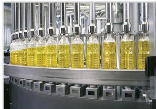
Figure 2 load cell at packaging line