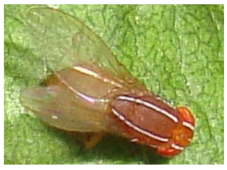
Figure 1. Zaprionus indianus.

Zaprionus indianus Gupta, 1970 (Diptera: Drosophilidae, Figure 1), commonly known as the "African fig fly," is an afrotropical drosophilid (Chassagnard and Tsacas, 1993) native to Africa, the Middle East, and southern Eurasia (Bächli, 1999-2010). It has received special attention because of its recent invasion of South and North America (Vilela, 1999; van der Linde et al. , 2006). In the Americas it was first reported from São Paolo, Brazil, in 1998 (Vilela, 1999) and subsequently from Uruguay (Goní et al. , 2001; Goní et al. , 2002), Northeastern Argentina (Lavagnino et al. , 2008), Ecuador (Rafael, 2007), Panama (van der Linde et al. , 2006), Mexico (Castrezana, 2007), the USA (van der Linde et al. , 2006; Castrezana, 2007), Venezuela and the Cayman Islands (KvdL, unpublished records).