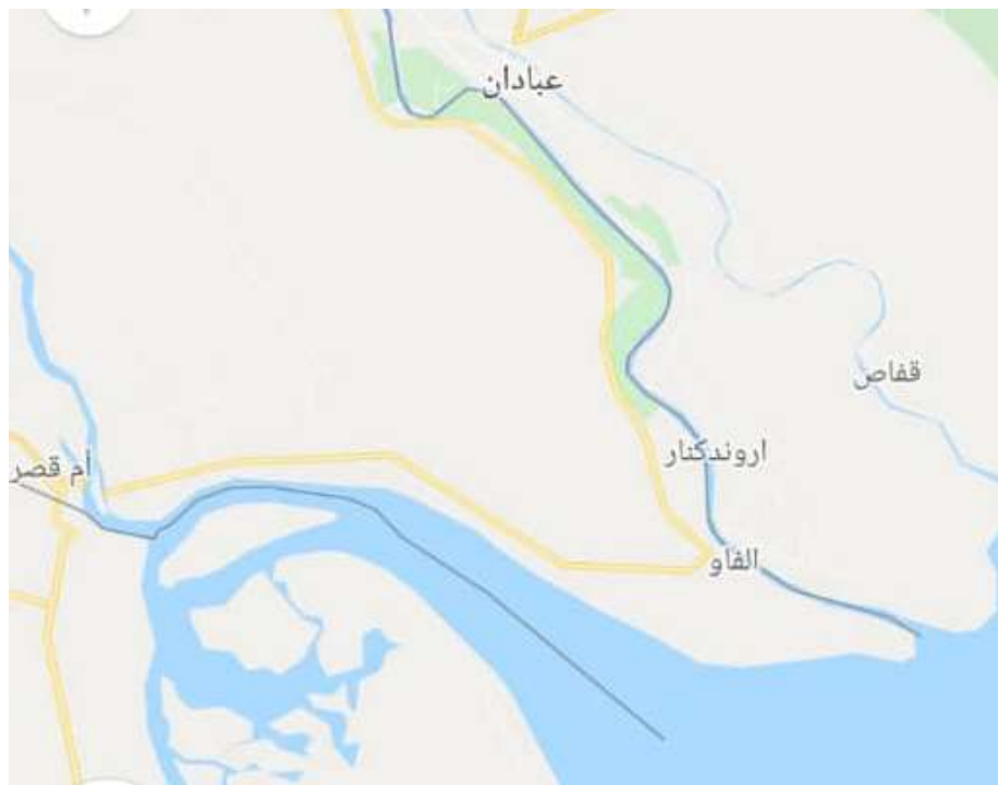
Figure 2. The area of Al-Faw Port, Khor Abdullah Canal and Khor Al-Zubair Canal from which the studied samples were taken