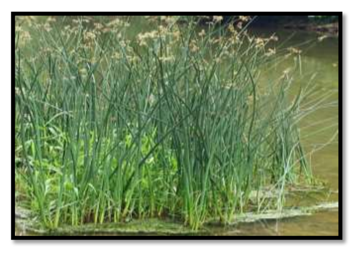
Image (1) Schenoplectuslitoralis collection site in south of Sindbad Island

Schoenoplectuslitoralis (Schrader) Palla, Bot. Jahrb. Syst. was collected from the south of Sindbad Island on the banks of the Shatt al-Arab (image 1).Samples were kept in plastic bags after cleaning with river water.