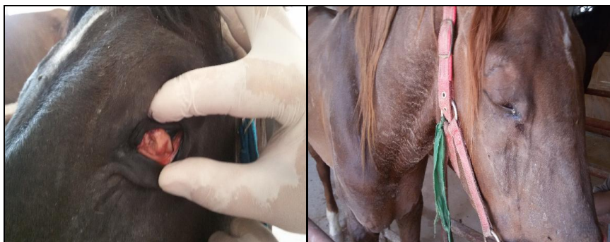
Severe conjunctival hyperemia and Serous ocular secretions

Diseased drought horse show signs of, debility, severe conjunctival hyperemia, serous ocular secretions, restless and anxiety, However flies were detected around the eyes, which become slight edematous, furthermore animal show photophobia and blepharospasm. No fever were detected in infected animals, However there were Dyspnea on inspecting the chest and dry rales and tachycardia were detected on lung and heart auscultation.