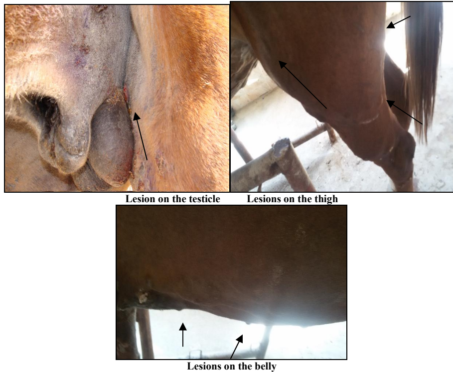
Lesion on the testicle