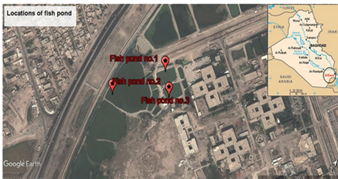
Fig. 1. Sampling sites.

Nine water samples were collected from three Cyprinus carpio (Common carp) fish ponds located in Marine Science Center- Basra University, Al-Garma campus (Fig. 1), with coordinates as