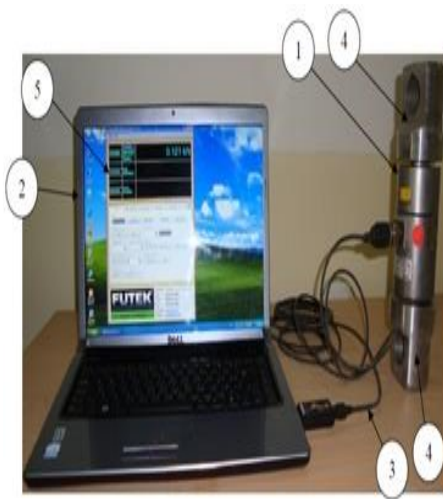
Fig. (1): Measurement device of draft force

Abbreviation: 1-Load cell. 2- laptop. 3- USB connection. 4- Two rings to fixation of the load cell. 5- program recorded and saved data of draft force.