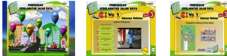
Fig. 1. Multimedia related learning materials in the ROSE courseware

Virtual reality enables users to experience the sensation of presence in different physical places [6]. In teaching and learning in schools, VR is able to provide a new way of reaching more students [40][56][5], facilitates them in experiencing learning [63] [38] [61] [7] and allows them to practice risk-free procedures through simulations [57] [54] [33] [32]. For ROSE courseware, VR has been used to simulate zebra and pedestrian bridge crossings as shown in Fig. 2.