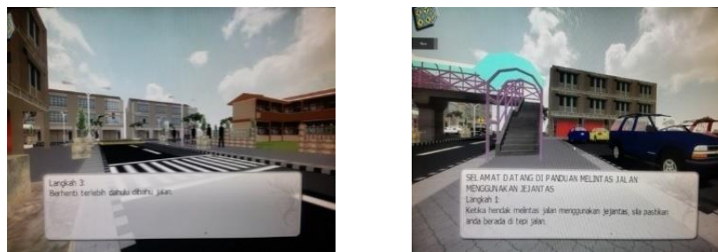
Fig. 2. Virtual reality related learning materials in the ROSE courseware

Virtual reality enables users to experience the sensation of presence in different physical places [6]. In teaching and learning in schools, VR is able to provide a new way of reaching more students [40][56][5], facilitates them in experiencing learning [63] [38] [61] [7] and allows them to practice risk-free procedures through simulations [57] [54] [33] [32]. For ROSE courseware, VR has been used to simulate zebra and pedestrian bridge crossings as shown in Fig. 2.