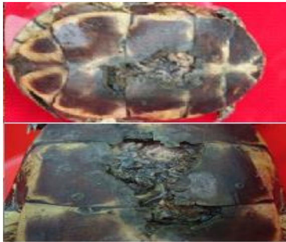
Figure 1. Caspian Turtle Mauremys caspica (Gmelin, 1774) East of Al-Hammar Marsh-Iraq showing Skin lesions.