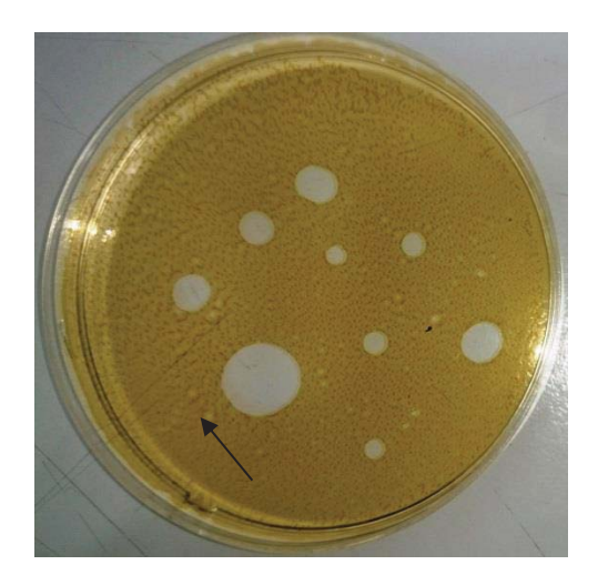
Fig. (3) Dispersion of crude oil by biosurfactant.