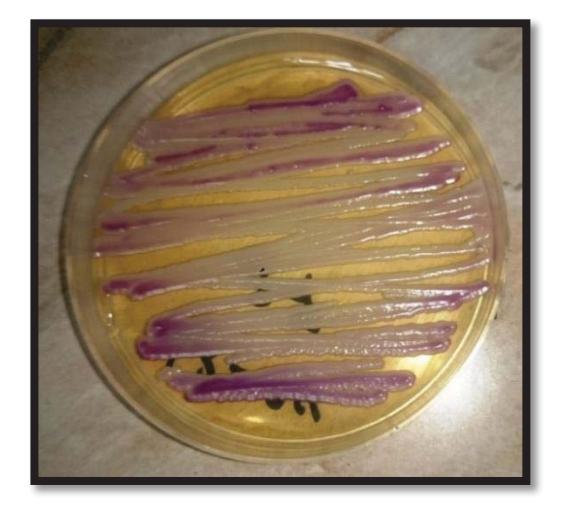
Fig. (1) Candida on CSB mediumFig. (2) Candida cruzi on HicromCandida Differential Agar