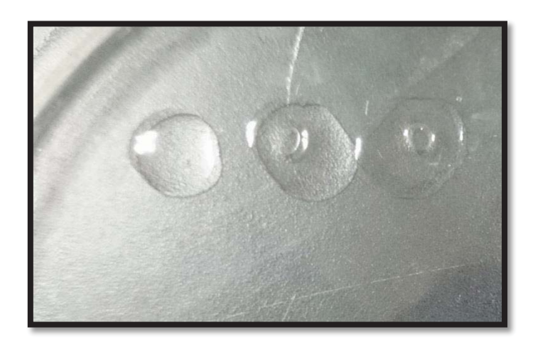
Fig. (5) Oil collapse of mineral oil drops.