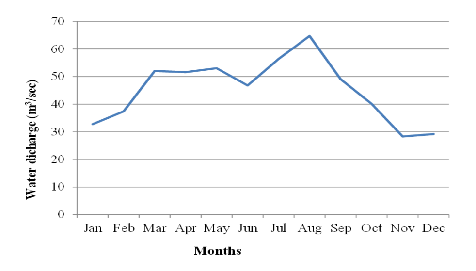
Figure 3. The water discharge releasing to the Shatt al-Arab River from Qal'at Saleh regulatory gate in Maysan province