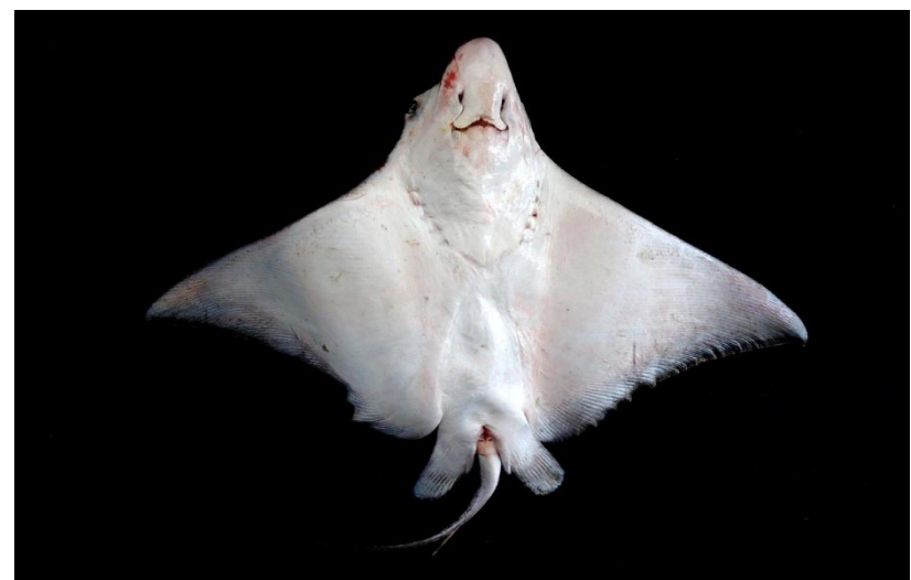
Figure (3). Ventral view of A. flagellum from Shatt Al-Basra canal, south of Iraq.