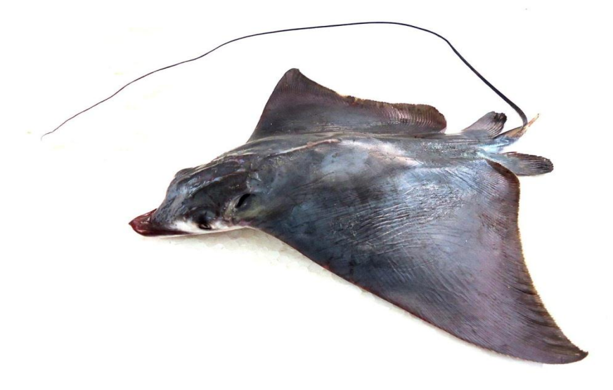
Figure (4). Lateral view of A. flagellum from Shatt Al-Basra canal, south of Iraq.

(proceeding of 1<sup>st</sup> National conference of science and Art –University of Babylon).